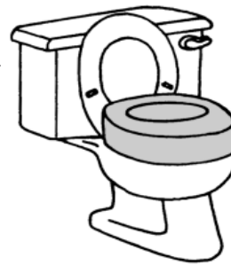
Raised (Elevated) Toilet Seat

If the mobile person is missing the toilet, get a toilet seat in a color that is different from the floor color. This may help them see the toilet better. If the person with AD fails to remember to wipe himself or herself or wash their hands, you will have to prompt them to do it, help them to do it, or do it for them.